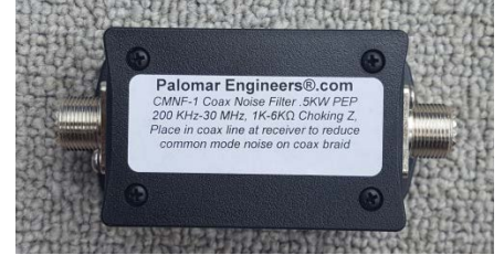
Coax Noise Filter